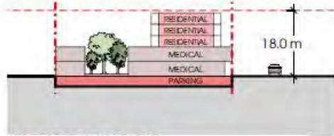
INDICATIVE SECTION HEIGHT PLANE

Maintain existing site extents and provide a 'medical mixed use' building consisting of 5 storeys as per current controls. Ground and first floor to be non residential use. Remaining upper levels to be residential. Provide for a pedestrian through site link between Orth St and Rodgers St which can be activated by ground floor commercial use.